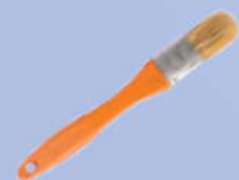
Bus bar brush