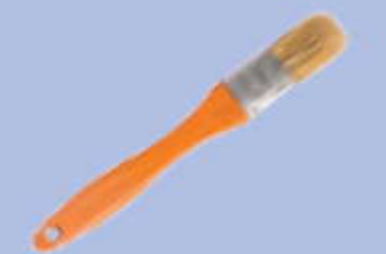
Bus bar brush