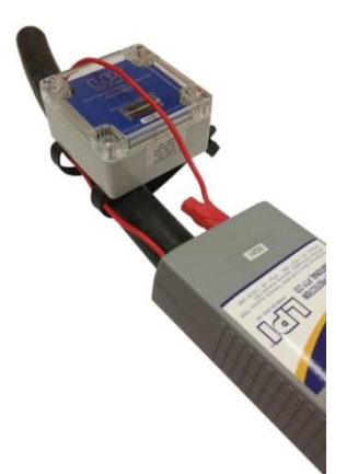
Figure 4: Step 2