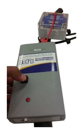
Figure 5: Step 3